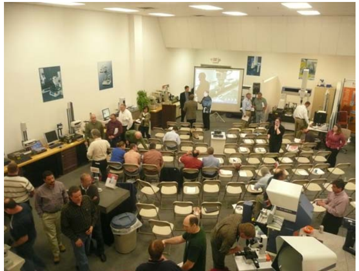
Seminar attendance was at record proportions